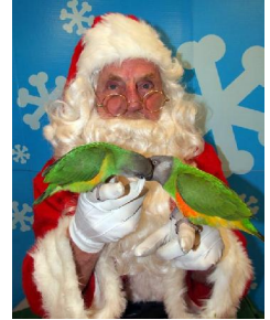
Two parrots enjoying Santa's company

VPAS would like to thank each and every volunteer who donates their time to help our wonderful pets.