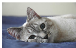
Gizelle, an adoptee and VPAS' poster kitty

care provided for it until it finds its' forever home. This endeavor would not be possible without the fabulous community members and volunteers who donate their time, money, and resources to help us save lives.