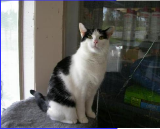
Lucy, posing for the camera

Meet Lucy, a beautiful, 3 year old, spayed female cat. Lucy came to VPAS in January of 2007; an allergy in the family forced them to relinquish her. Lucy's personality is a unique blend of sassiness and cheeky humour. She always makes us