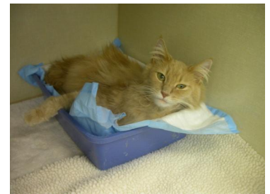
Sushi in the hospital, recovering from her leg amputation

VPAS would like to thank all of those who made donations to purchase the supplies that were needed for Sushi's surgery to be performed.