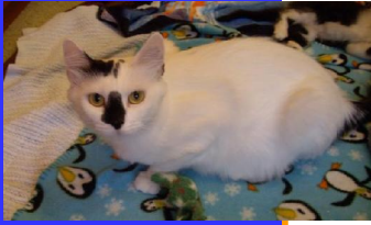
Eve enjoying her foster home

This beautiful kitty is Eve. She and her 5 kittens, just hours old, arrived at VPAS late at night after being found in a box on the steps of a church. They were very hungry, and cold, and one of the kittens had already died. After some time in foster care and much