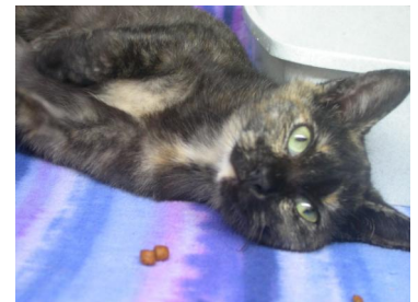
Pumpkin enjoying her new blanket while in the adoption centre.

was diagnosed with Cerebellar Hypoplasia (CH), a congenital neurological disorder that affects coordination and movement. It took Pumpkin a few weeks to figure out how to walk once she was strong enough to do so, and because of her CH she still walks with a wobble, but she is now healthy as a horse and enjoying life in her adoptive home.